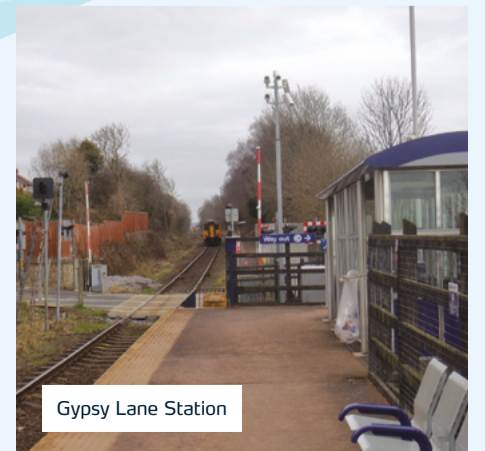
Gypsy Lane Station